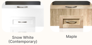
Snow White (Contemporary)